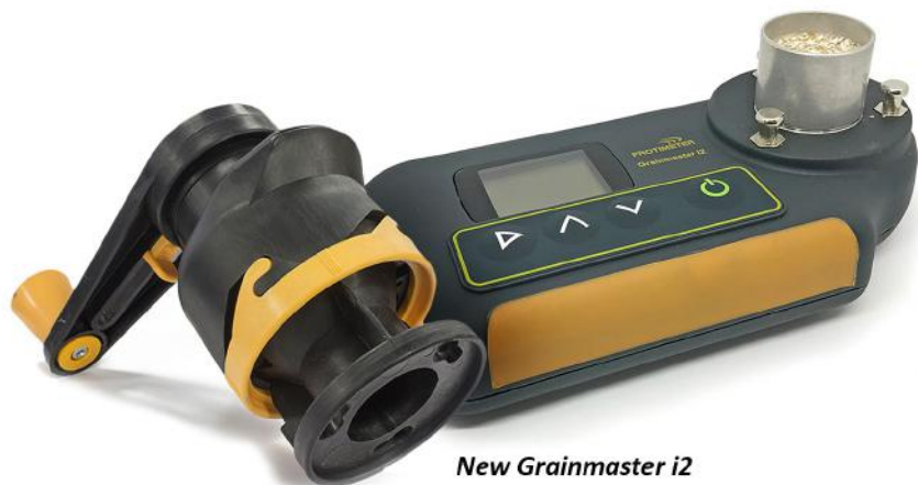
New Grainmaster i2